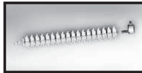
#2 Rotisserie Motor