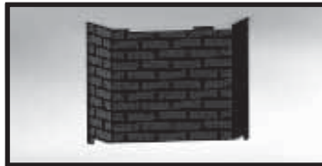
#5 Refractory Kit