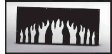
#6 Flame Screen