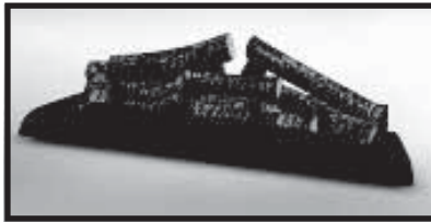
#4 Log/Grate Assembly